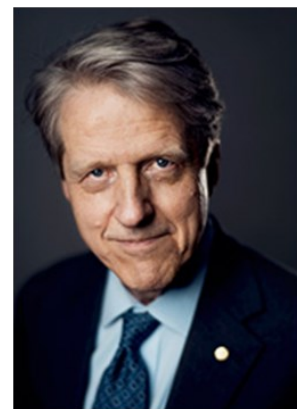
Robert J. Shiller