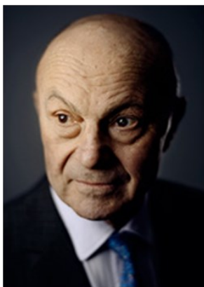
Eugene F. Fama

Source: http://www.nobelprize.org/nobel_prizes/facts/