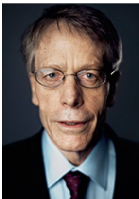
Lars Peter Hansen