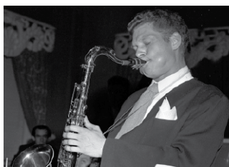
Back Cover: Zoot Sims - February 24, 1955