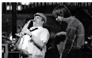
Centerfold: Phil Woods (alto), Hal Galper (piano), and Tom Harrell (trumpet) at the Starlite Club, Massachusetts on September 14, 1985.

The Note is published by the Al Cohn Memorial Jazz Collection, East Stroudsburg University of Pennsylvania, as part of its educational outreach program.