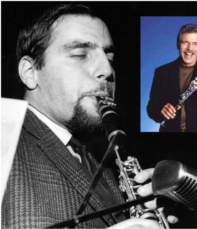
Eddie Daniels at The Five Spot NYC 1967

playing with him. One time I was invited up to his house to play duets with him in his own living room.