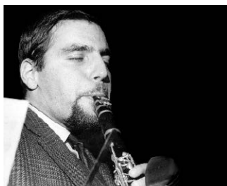
Cover Photo: Eddie Daniels at The Five Spot NYC 1967 Credit: (c)Raymond Ross Archives/CTSIMAGES. Used with permission.