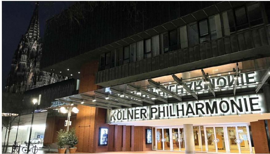
Köln Philharmonie at night