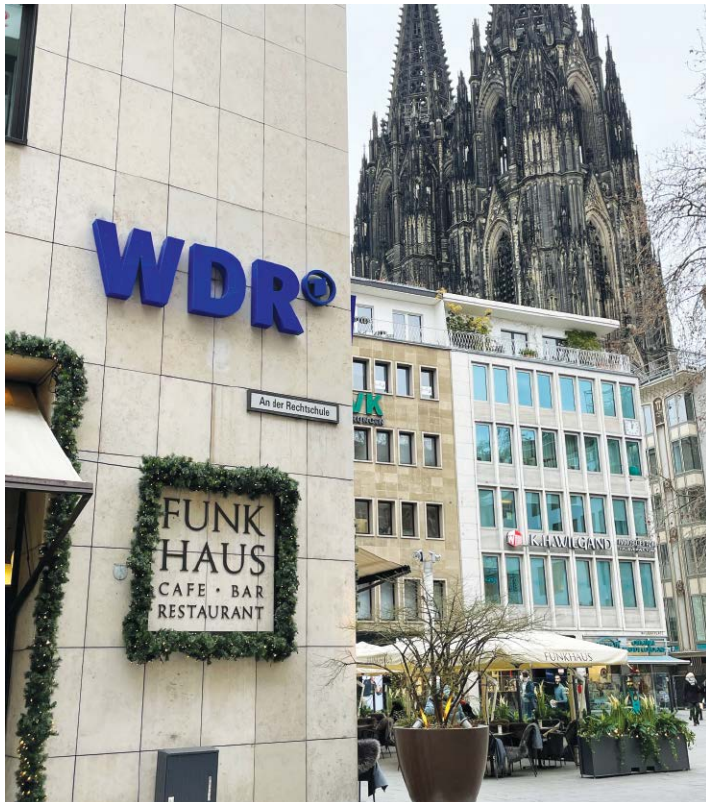
The WDR building with the Cologne Cathedral in the background.

December 2021 was significant for the ACMJC as well as for Phil Woods. I was lucky enough to travel to Cologne, Germany to perform a project of Phil's music with the WDR Big Band called A Phil Woods Legacy . We put together a project of some of my favorite Phil compositions, as well as prioritizing his unrecorded and lesser-known works.