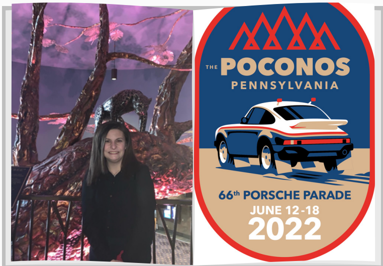
66th Porsche Parade Kalahari Resorts