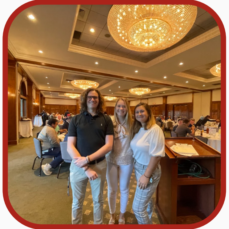
College of Business and Management Golf Fundraising Event