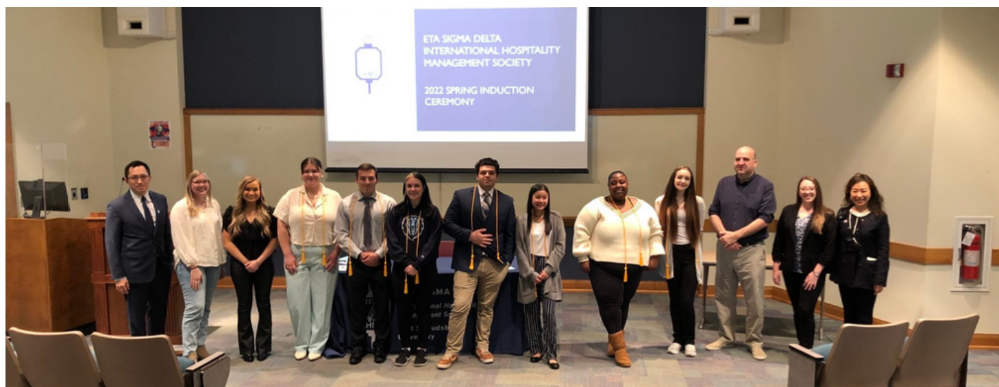
ESD Induction Ceremony