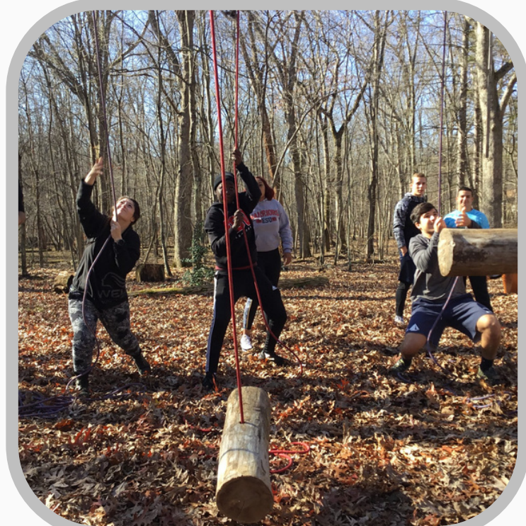
Stony Acres Challenge