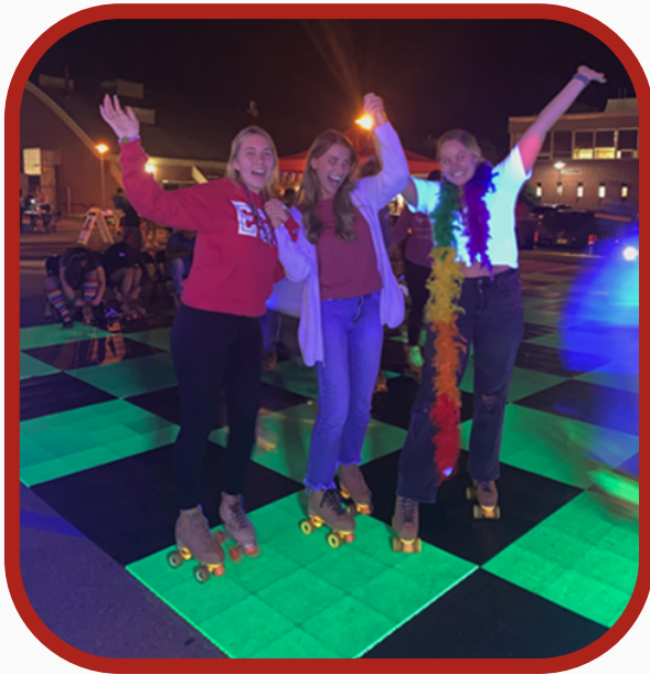
ESU Pride Rally

Students in our event planning courses have been exposed to necessary event planning skills such as: designing the meeting experience, strategic planning, site, and venue selection, negotiating contracts, budgeting, and marketing the meeting. Students have also helped plan departmental and campus-wide events as well as completed professional events and meeting planning internships in resort and convention centers.