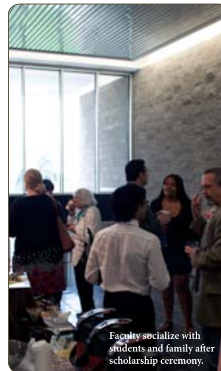
Faculty socialize with students and family after scholarship ceremony.