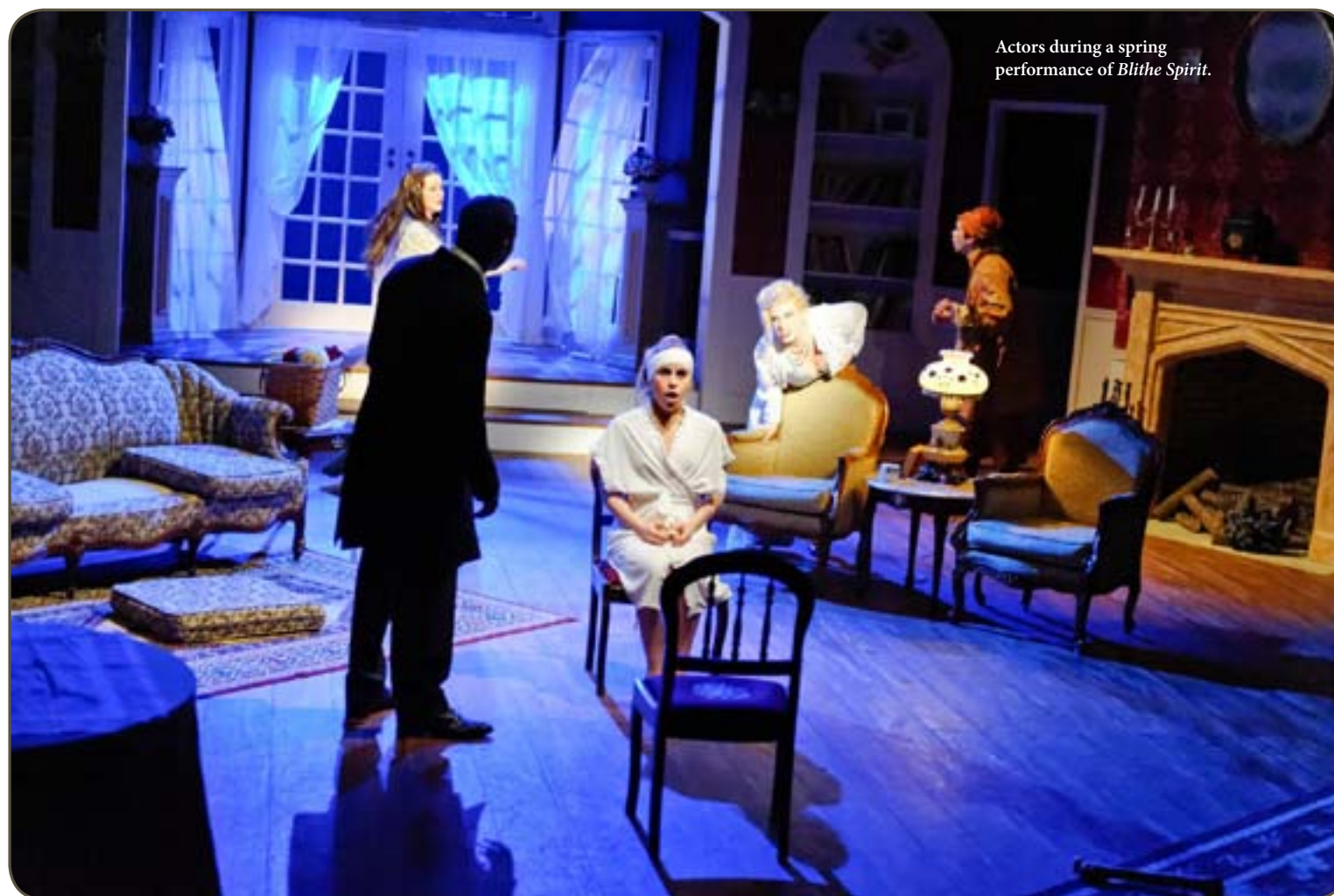
Actors during a spring performance of Blithe Spirit .