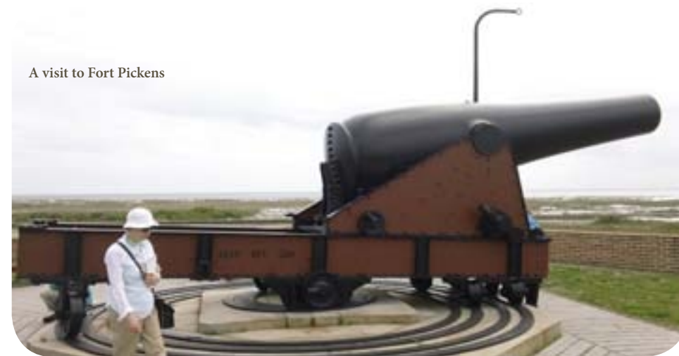
A visit to Fort Pickens