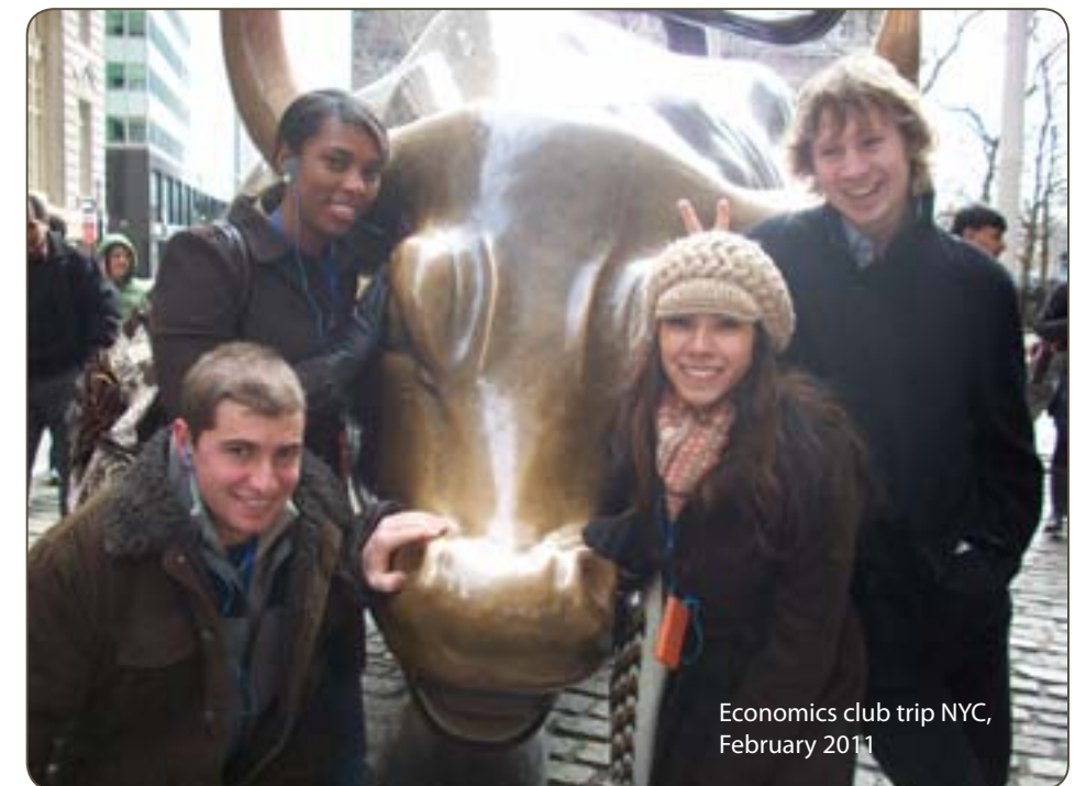
Economics club trip NYC, February 2011