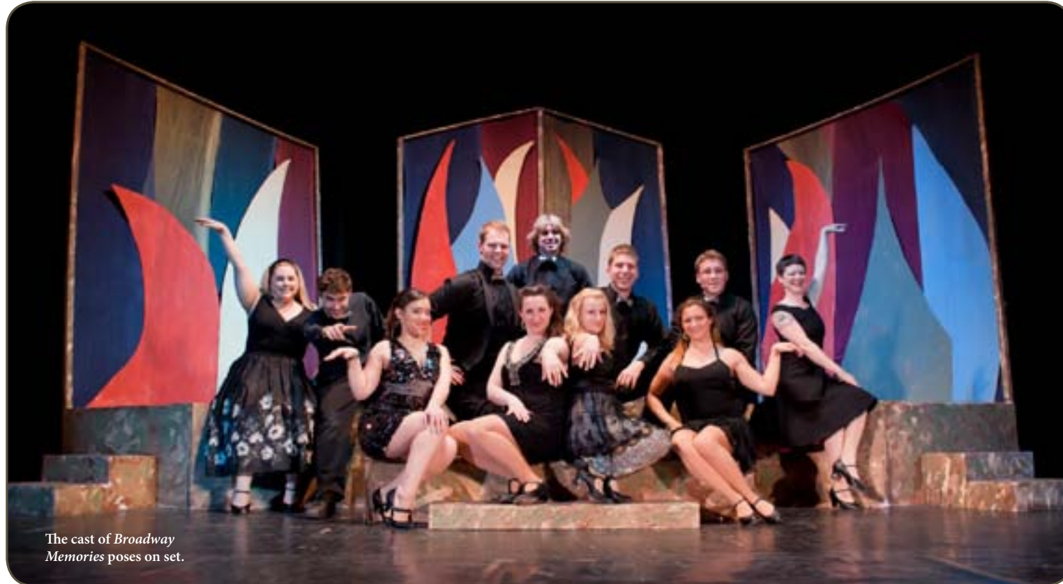
The cast of Broadway Memories poses on set.