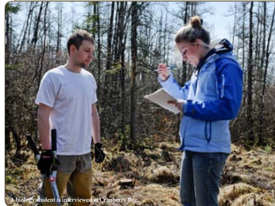
A biology student is interviewed at Cranberry Bog.