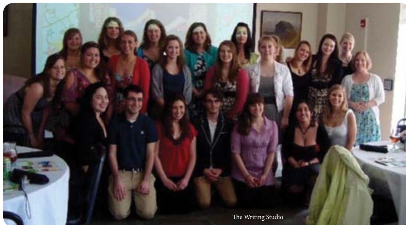
The Writing Studio