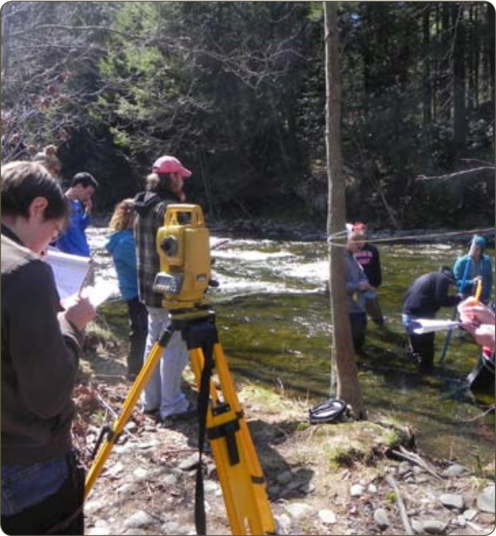
Field trip for Stream Geomorphology lab.