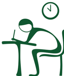
Basic Skills Test Link

Passing scores for each assessment can be found by clicking on the link below and following “#2 Certification Test and Score Requirements.” Once on this page, click “#1 Basic Skills Tests.”