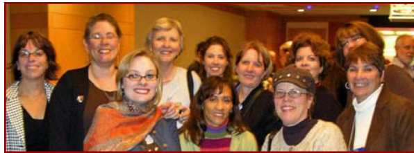
NPWP attends the Annual meeting in New York City

The conference included lectures, roundtable discussions, workshops,