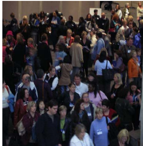
Teachers teaching teachers: NWP members from across the country met in New York City to learn from each other.

for Inquiry: This was a very helpful session for me, NPWP's tech liaison. Through writing and discussion, we explored what identity we each want our NWP site to have on the web, our website's purpose/intended audience and future possibilities. Further, I was able to talk with many other tech liaisons (representing Minnesota, Florida, Michigan, South Carolina, Georgia, California and Alabama) some who were more lost than I (believe it or not) and those that were willing to lend the rest of us a hand.