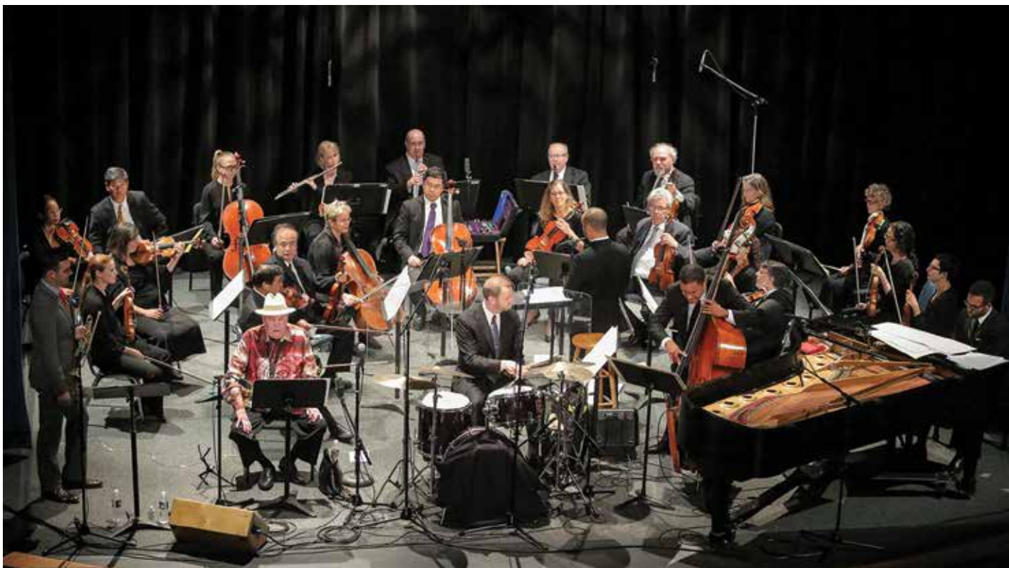
Phil Woods with the Pittsburgh Symphony Orchestra

It was 1931. The War was raging. I’m sure you heard about it; it was in all the newspapers. (Laughter) And I, my major thrust of life was to melt lead and make toy soldiers. So that’s what I did during the War. And I was poking around in my Grandma’s wicker sofa and I saw this box. And I opened it up and it was a saxophone. I said, “Oh, I can melt that sucker down.” (Laughter) Somebody mistook my illegal attempt at stealing it and melting it down and gave it to me to play. So I, you know, I took it and I put it in the closet, where I thought it belonged and went back to my major force, which was melting lead and making soldiers. My mom, finally, she said, “Philip,” and when she said “Philip” like