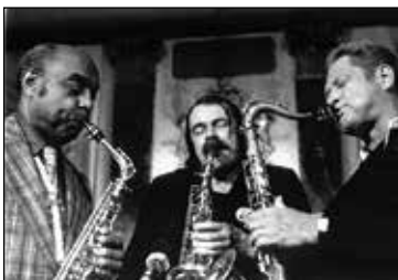
Center Spread: Phil Woods and friends; Benny Carter, Phil Woods, Zoot Sims.