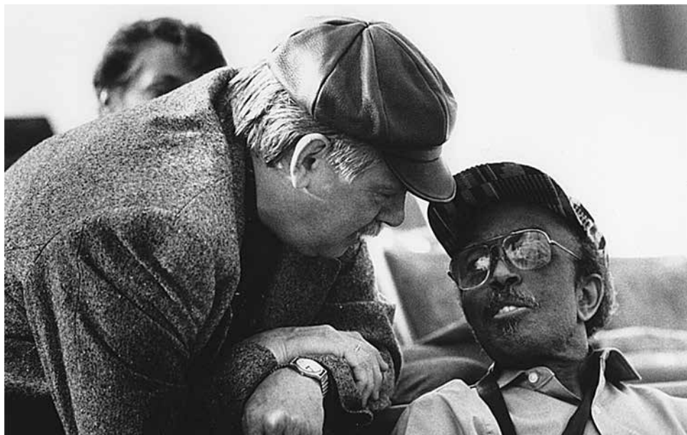
Phil speaking with Jimmy Heath.