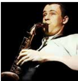
Cover Photo (front): A young Phil Woods.